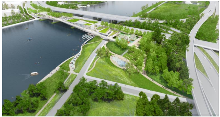
Landscape architects are leading the design of the 11 th Street Bridge Park. The park will better connect the city on both sides of the Anacostia River by transforming an aged-out freeway bridge into a one-of-a-kind civic space. Image and Landscape Architecture Firm: Olin.

Landscape architects connect communities by designing multiuse transportation corridors that accommodate all users, including pedestrians, bicyclists, motorists, people with disabilities, and people who rely on public transportation. Active transportation reduces reliance on single-use automotive transport, which in turn reduces traffic, improves air quality, and promotes a more active way of life.