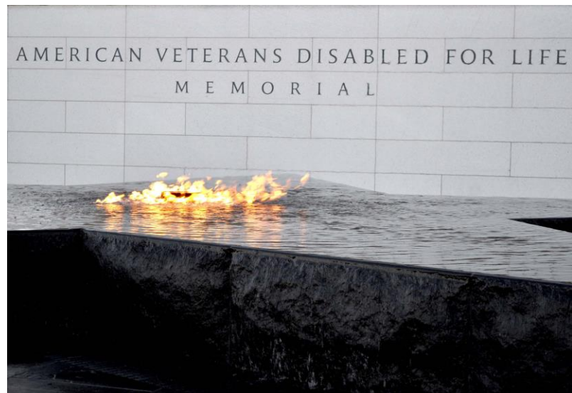
Dedicated in 2014, the American Veterans Disabled for Life Memorial is the first national memorial honoring disabled veterans from all service branches and across all generations. Designed by Potomac Chapter Landscape Architecture Firm: Michael Vergason Landscape Architecture

Landscape architecture is regulated by state licensure requirements. Becoming licensed generally requires a university degree in landscape architecture and completion of a period of supervised practice. All states require passage of the extensive four-part national licensing examination.