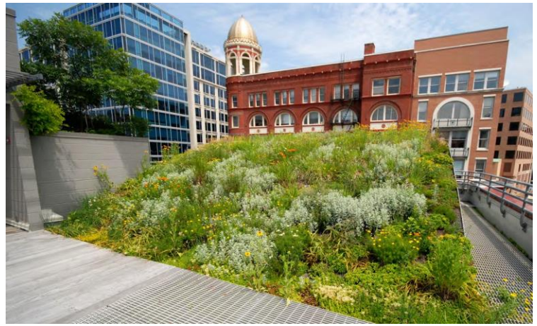
The green roof on the ASLA's headquarters in Chinatown is one example of how landscape architects help reduce stormwater runoff while also conserving energy and improving air quality.

The ASLA was recognized by DC DOE as their 2014 Environmental Partner of the Year Award for our work on green roof education.