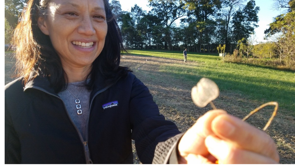
Photograph of Client On-Site